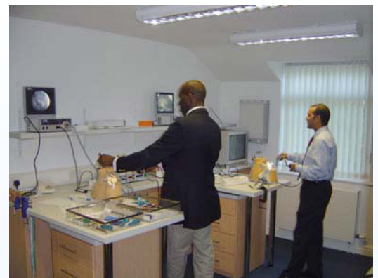
The shoulder fellows practising in the RSU Bio-skills Laboratory

As part of the shortlisting process applicants may be expected to complete a brief test paper within time constraints, details of which will be provided at a later stage.